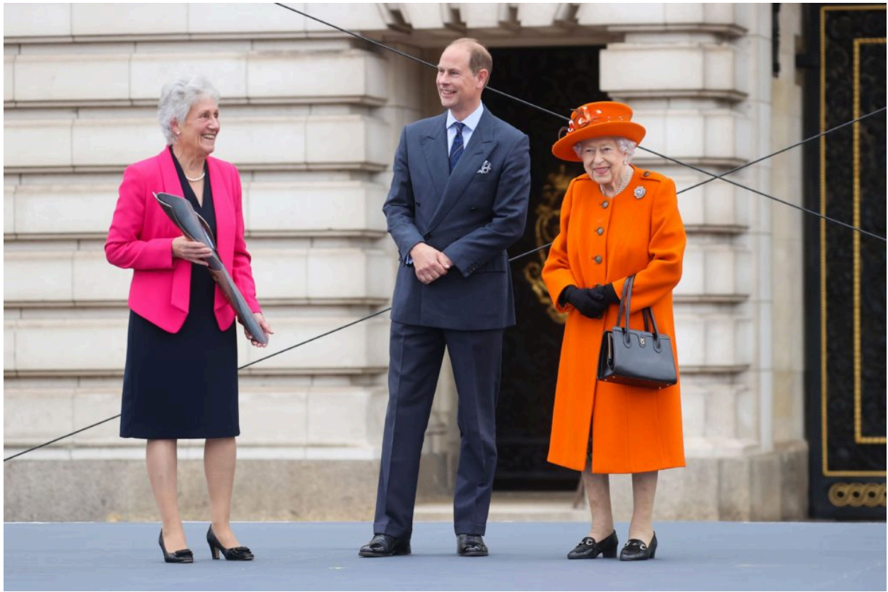
Dame Louise presenting HM The Queen with the Baton at Buckingham Palace, 7 October 2021

To represent the bronze, silver and gold medals that athletes will be competing for, the Baton has been cast using accessible, non-precious metals of copper, aluminium and brass. By using aluminium forged using the traditional method of lost wax casting in Birmingham's Jewellery Quarter, the Baton has used the centuries of local expertise and craftsmanship that gives Birmingham its reputation as the city of a thousand trades.