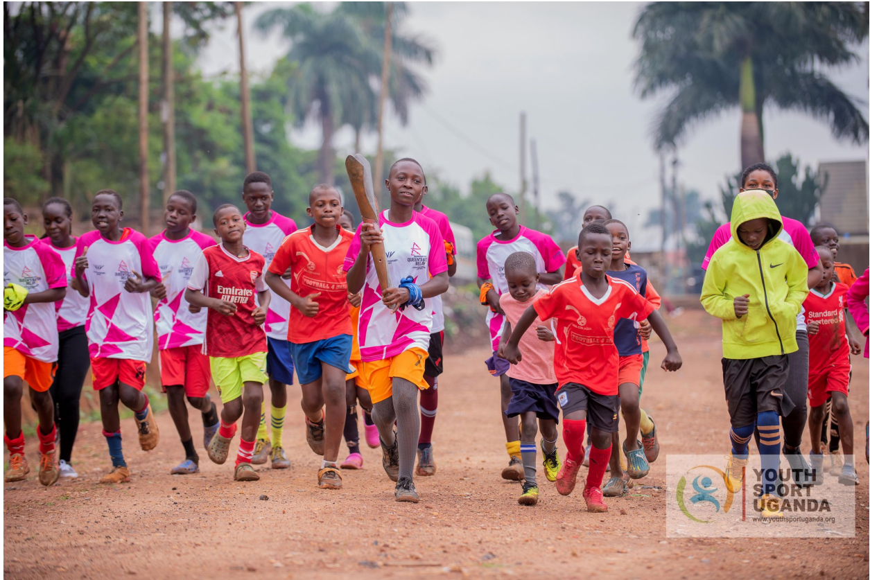
Young Baton Bearers in Uganda