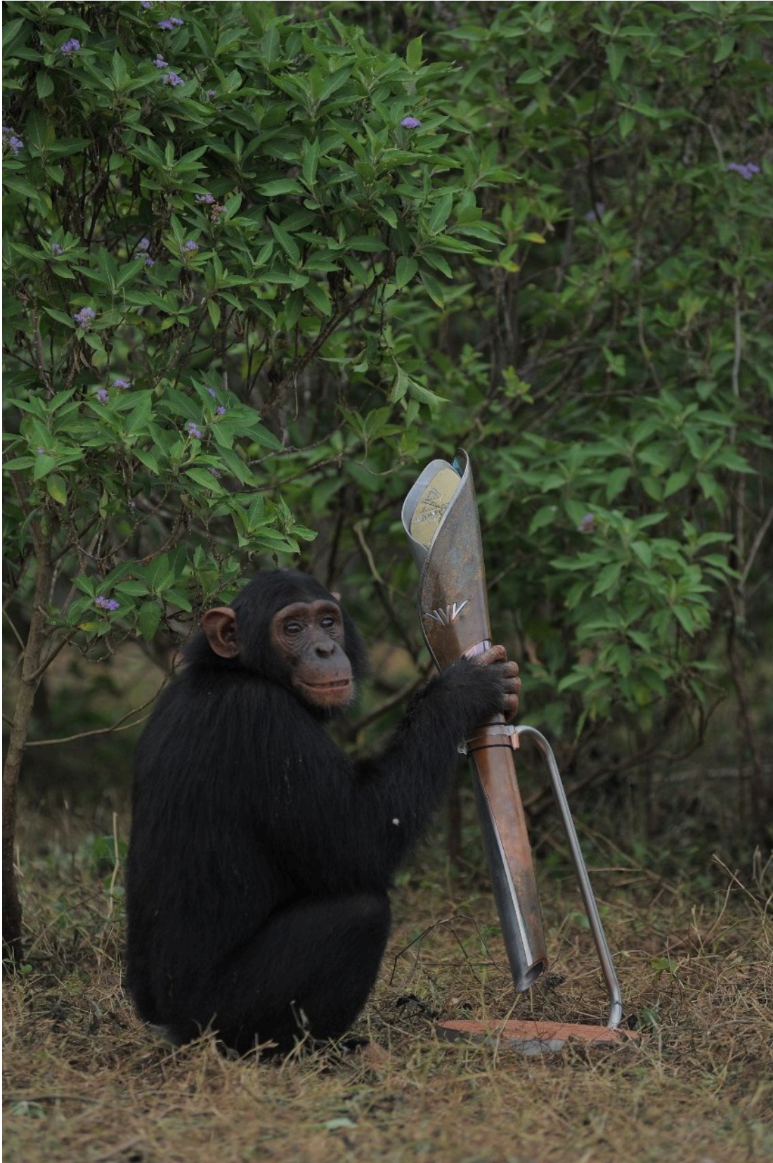
Easy the Chimpanzee at the Ngamba Island Chimpanzee Sanctuary, Uganda